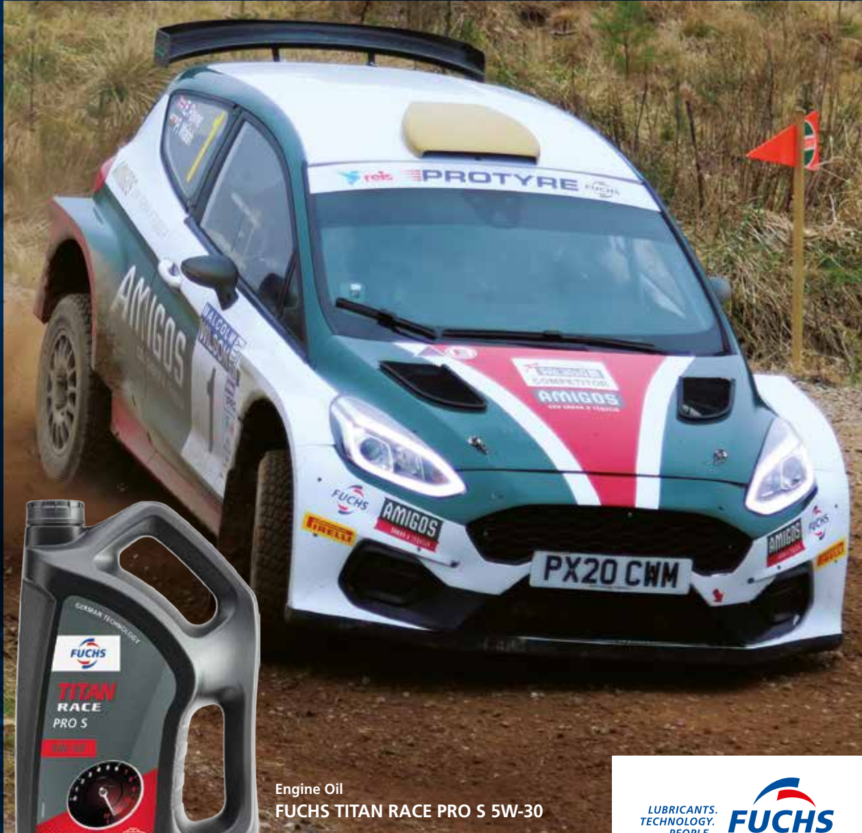
Engine Oil FUCHS TITAN RACE PRO S 5W-30

As used by 2024 FUCHS LUBRICANTS BTRDA Gold Star Champion Elliott Payne - Pictured